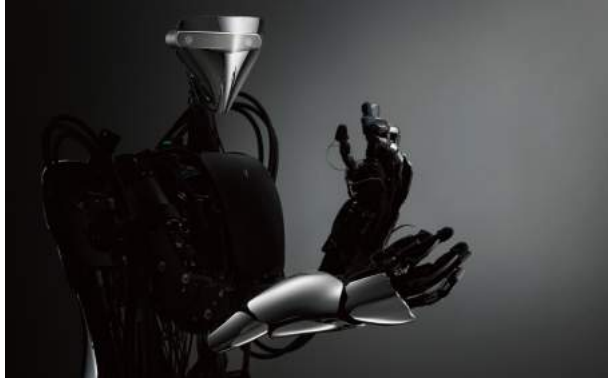
MELTANT Series [MELTANT-α]