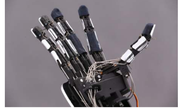
MELTANT Series [MELT-HAND]